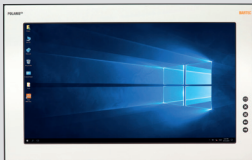
POLARIS Professional 17.3" W