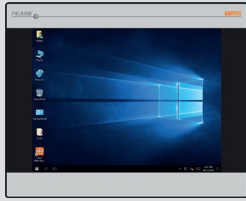
POLARIS Professional 15"