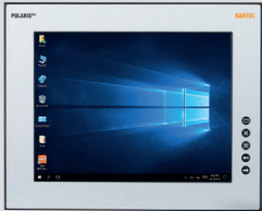
POLARIS Professional 15" Sunlight