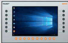
POLARIS Professional 12.1" W