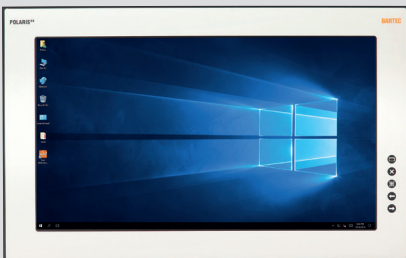
POLARIS Professional 24" W